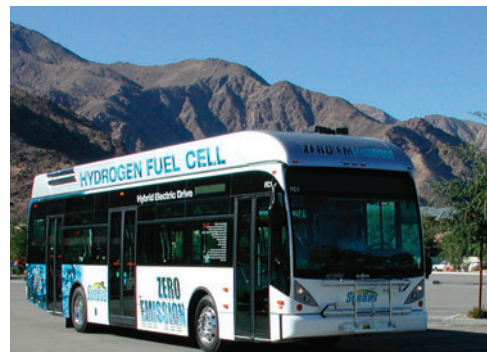
VanHool A330 Fuel Cell Bus